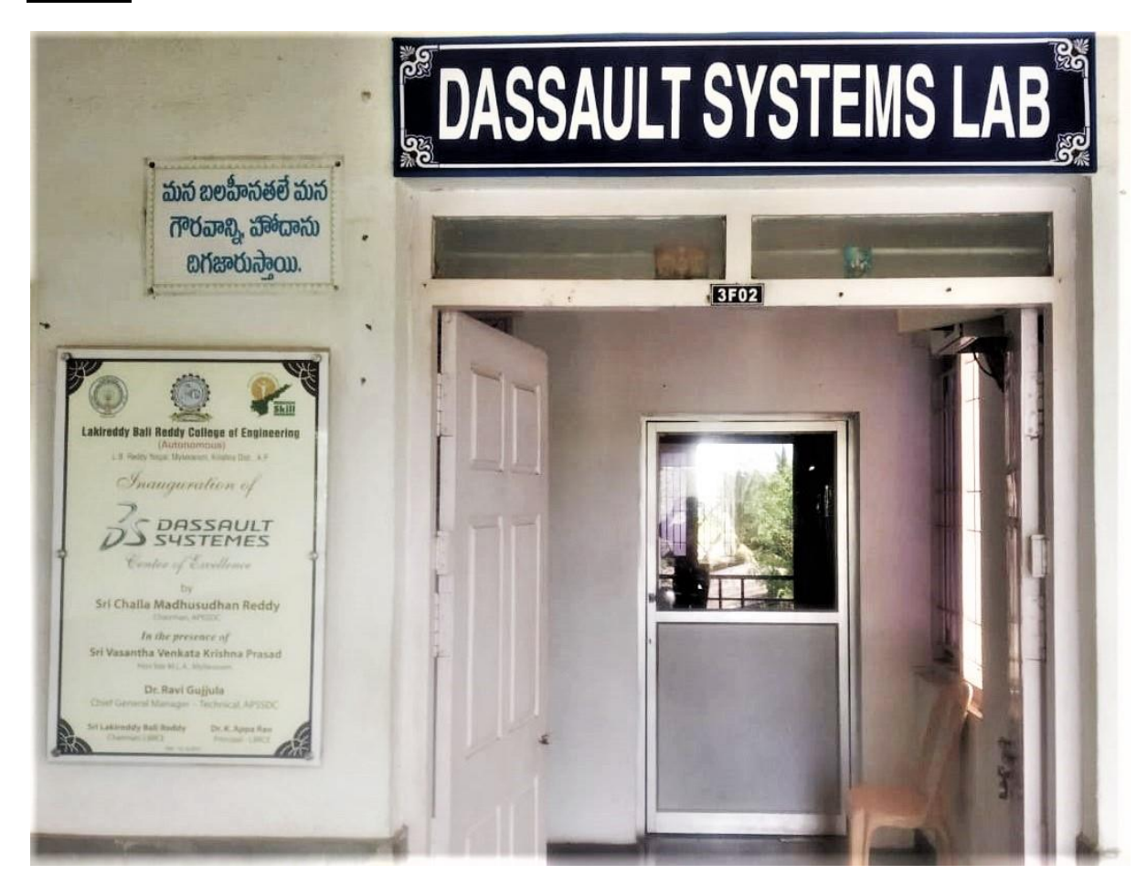
Fig.1 Dassault Systems LAB